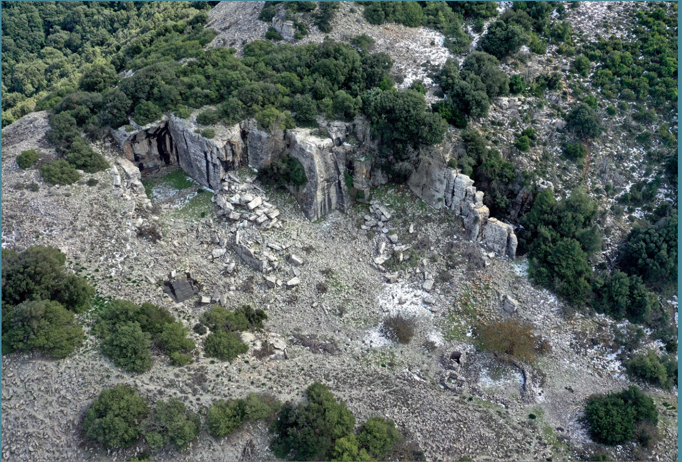
Cipollino marble quarries near Styra, Euboea

International Workshop, October 17–19, 2025, Athens – Euboea